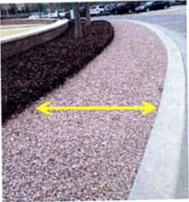
Gravel Bed Detail