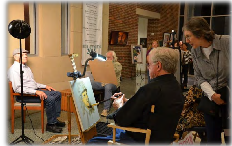
Portrait "Paint Off", Keller Town Hall 2016

paintings, and sculpture, the diversity, heritage and unique character of a group or area can be captured, preserved, and shared with visitors and locals alike.