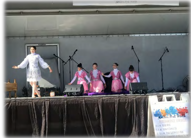
Trinity Dance Company performs selections from The Nutcracker at Keller Art Walk, 2019

Careful planning and evaluation go into each program, event and permanent piece to ensure the arts in Keller remain accessible to the public. Not only does the City offer a burgeoning list of art-related activities for the public to experience, the annual Keller's Got Talent show provides an opportunity for local artists to participate and showcase their abilities in their own community.