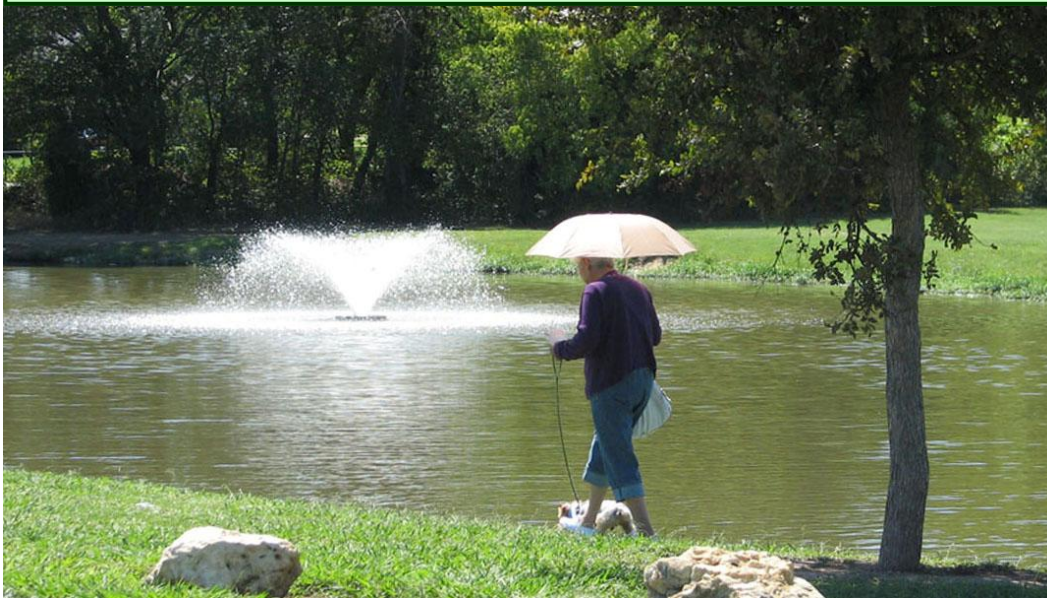
An elderly lady with parasol and dog strolls past the trumpet-like fountains along the creek.