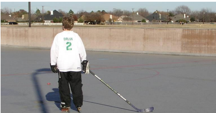
True to being a community park, Bear Creek Park provides the opportunity for a wide variety of recreation activities.