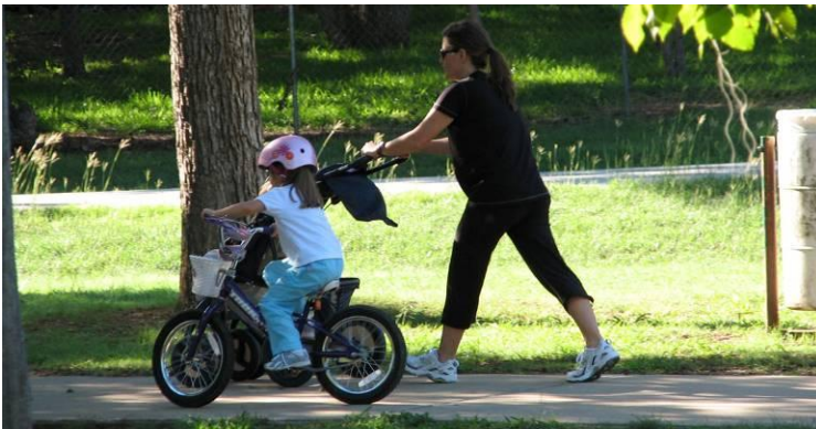
Wide, shady trails are easily accessible and popular with every age.