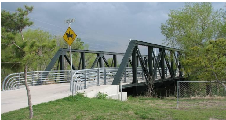
As an horseback and pedestrian entry way to Keller Sports Park, this relocated old bridge adds character and a sense of identity to park.

There are two playgrounds; the children’s play area off in the west corner near the soccer fields, while out of harm’s way, seems small in proportion to the park and its amenities. This play area should be larger and well shaded. It is recommended that a general analysis of use be conducted to determine strategic locations for additional play areas and group shade structures.