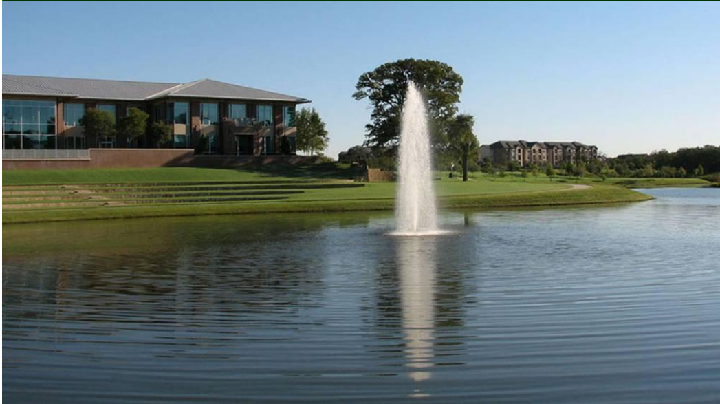
The columnar fountain jet acts as a focus for the Town Hall and park users.