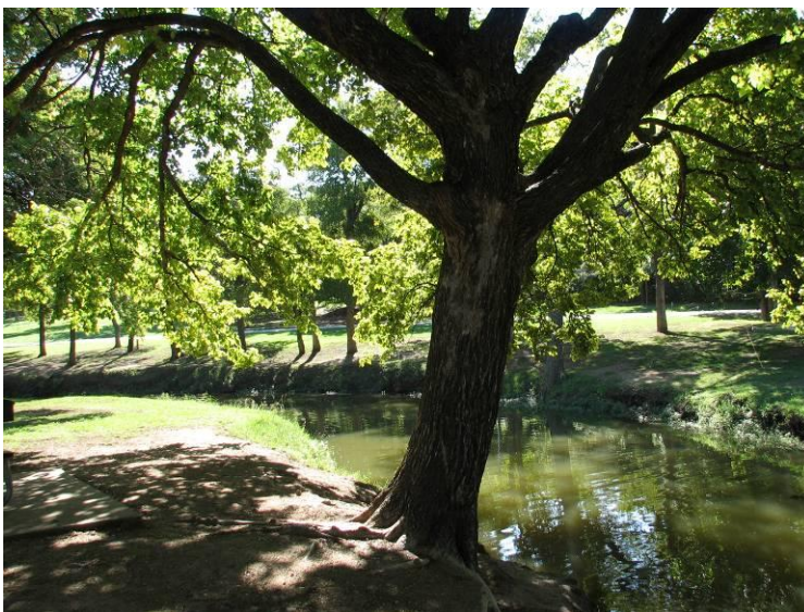
Sheered creek banks show signs of erosion. Water edge plants and a wide, no-mowing zone is recommended along the edge of the creek.