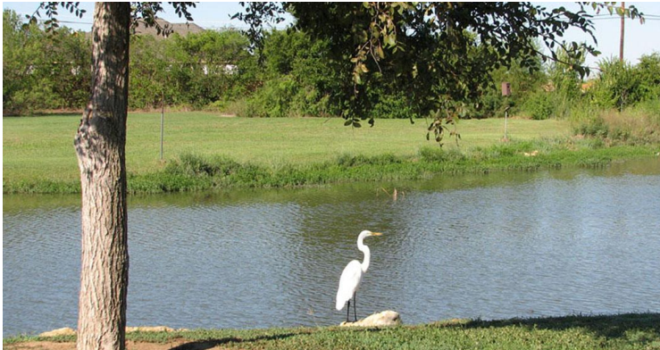
Birds such as this egret add to the serenity of the park.