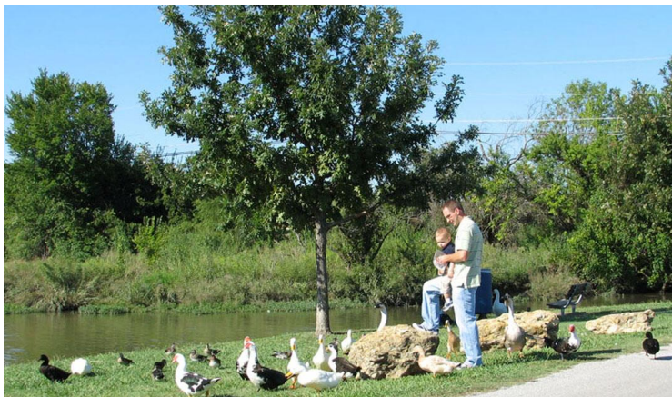
A father holding his toddler son, comments “Bear Creek Park is unique – there’s really not another park like it anywhere else.”

In the case of the in-line hockey rink, its popularity and years of service are evident and signs of wear are planned to be addressed at the two proposed in-line hockey rinks, identified in the Keller Sports Park Master Plan.