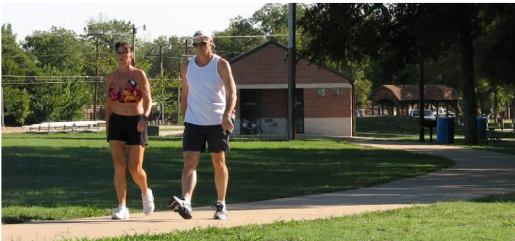
Walking is a favorite past time in Bear Creek Park.